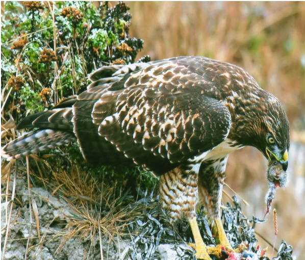
Source: Jurvetson, S. Red Tailed Hawk decapitating a California Meadow Vole. 15 December 2006.

In The Importance of Wild Animal Suffering , Alan Dawrst provides an example of a lion’s attack on a zebra: “The