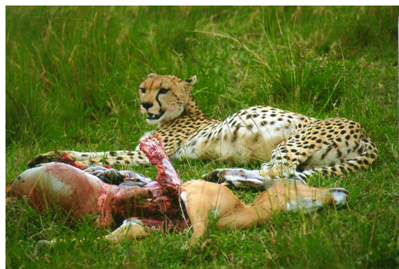
Cheetah with partially eaten impala. Marsai Mara National Park, Kenya. 14 July 2007.

The suffering of being suffocated to death, ripped apart while fully conscious, or injected with toxic venom occurs after a life that is often comprised of far more misery than happiness. Many if not most animals are frequently malnourished and dehydrated, witness the death of their young, and get stalked numerous times prior to a fatal attack.