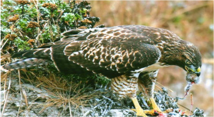
Red Tailed Hawk decapitating a California Meadow Vole. 15 December 2006.