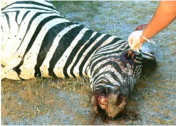
Zebra killed by Bacillus Anthracis Infection. 3 May 2010. Elainwe. Etosha National Park, Namibia.

Parasitologists speak of ectoparasitism when the uninvited guest lives on the surface of its host, and endoparasitism when the parasite dwells within. Among endoparasitic ichneumonids, adult females pierce the host with their ovipositor and deposit eggs within. Usually, the host is not otherwise inconvenienced for the moment, at least until the eggs hatch and the ichneumon larvae begin their grim work of interior excavation.