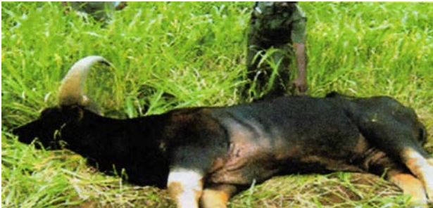
Indian Bison dead of dehydration. 30 September 2009.

Starvation is responsible for the deaths of billions of animals annually. Unlike a predatory attack which can lead to a violent but quick death, death by starvation can drag on for months. During the winter, food is hard to come by. Edible vegetation is often nonexistent or buried beneath snow packs. Many young, weak, and sickly animals cannot endure the lack of food and starve to death. A Michigan Department of Natural Resources study noted, “the number of species diagnosed at the laboratory as dying from malnutrition and starvation are second only to those dying of traumatic injuries.” 6 When food is so scarce that billions starve, those that do survive are often chronically hungry and malnourished.