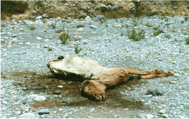
Salmonellosis. Michigan Department of Natural Resources and the Environment. 8 July 2010.

Those dying from dehydration are indicative of a far greater amount of misery. Consider being confined to a room with 9 other people where little or no liquid is available. All must remain in the room until one person dehydrates to death. Though only one of the ten dies, most in the room are likely to be suffering due to the lack of water.